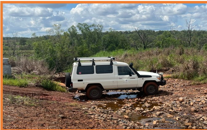
Team heading out for seed collection