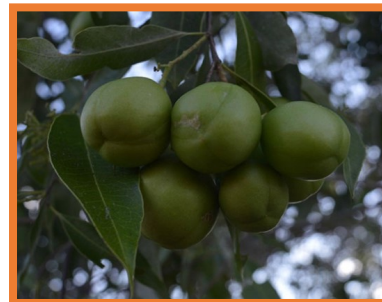
Denhamia Obscura Pods